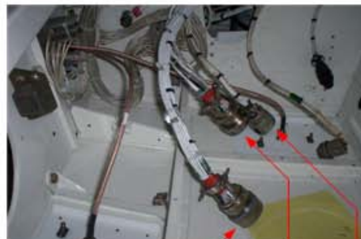
J10 Avionics Disconnect Plug P10 J9 Instrument Panel Main Disconnect P9 J110 Instrument Panel Secondary Disconnect P110 Instrument Panel Keylines Disconnect J25/P25 Left Hand Footwell