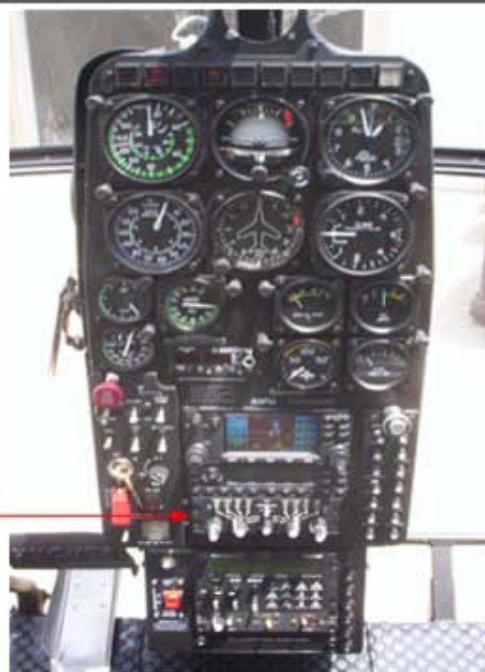
TAC200A Audio Control